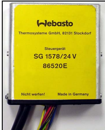
Old control unit - Fig. 1

This instruction is only valid for buses equipped with Webasto auxiliary heaters NGW300 built before January 2003.