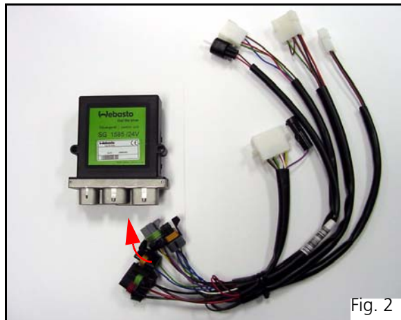
New control unit and adapter harness - Fig. 2